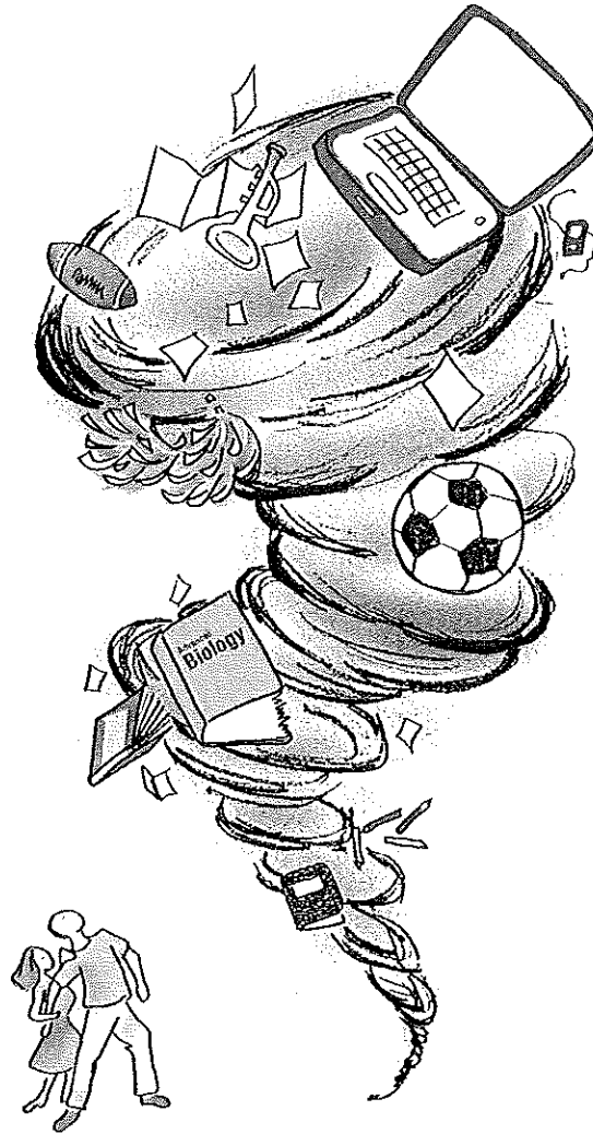
Illustration by Susan Ardis, 2009.